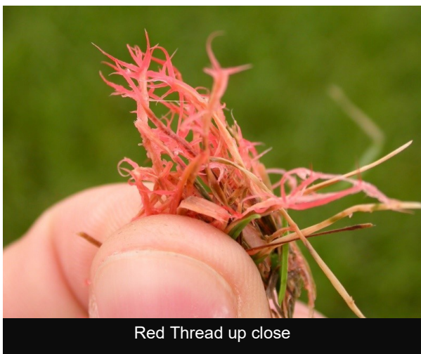
Red Thread up close

The easiest way to avoid lawn fungus is through proper maintenance and nourishment of the lawn to enhance microbial life in the ground. Lawn Doctor offers a Soil Enrichment Plus Program that includes health-boosting ingredients for your soil to fight off the summer's most common insects and disease, including Red Thread. As an added bonus, Soil Enrichment Plus improves lawn color to a richer, greener hue and reduces thatch build up to avoid issues like compaction and drought later in the year. Red Thread is tough, but a nourished lawn is tougher!