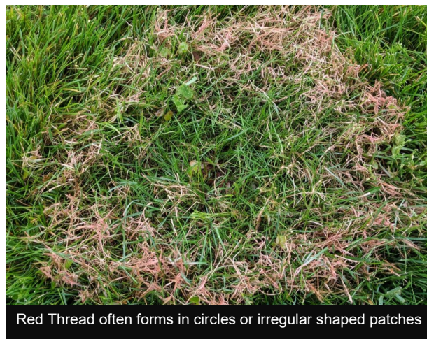
Red Thread often forms in circles or irregular shaped patches