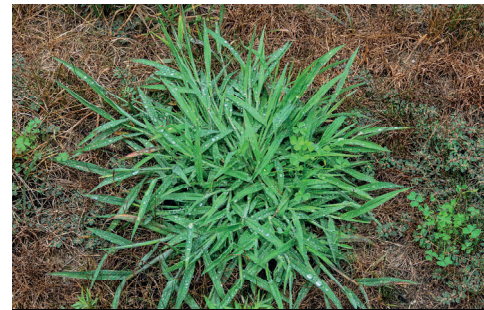
Spring seedings lead to crabgrass!