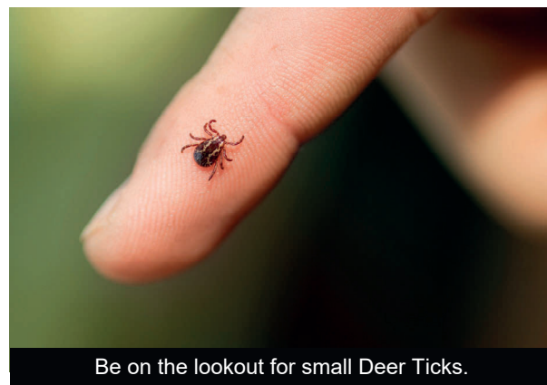
Be on the lookout for small Deer Ticks.

Lastly, spray your yard with tick control . Some products can only be applied by a state-licensed applicator. Call our office today to learn more about our LD Mosquito and Tick Control Program and how our certified technicians can help protect you, your family and your pets all season long. We've recently updated this service to include a Home Pest Barrier application that protects your home from creepy crawlies as well. By spraying the exterior foundation of your home during this visit your property is free of ticks, mosquitoes and so much more!