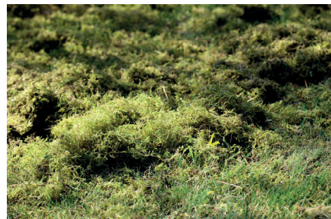
Moss will look better as the season goes on.