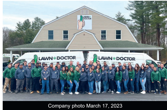
Company photo March 17, 2023