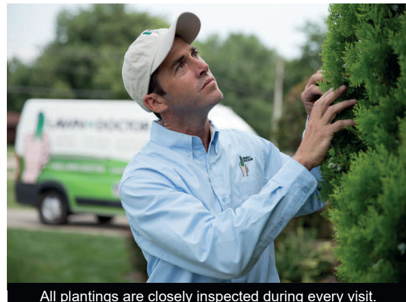
All plantings are closely inspected during every visit.