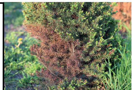
Winter-Damaged Spruce Tree

Anti-Desiccant is a one-time application that takes place in the early-wintertime, most typically in December. This service protects Evergreens against wilting, windburn, and moisture loss that can be otherwise detrimental.