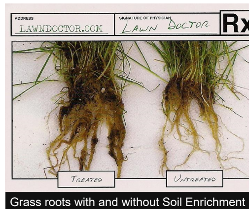
Grass roots with and without Soil Enrichment

Soil Enrichment Plus is the perfect conditioning treatment to act as either a preventative for lawn problems or a weapon to tackle them if they occur. With Lawn Doctor's powerful ingredients, summer stressors don't stand a chance in taking down your turf.