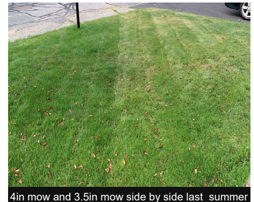
4in mow and 3.5in mow side by side last summer

Long grass in the summer starts in the late spring. Once the grass gets stressed due to extreme weather, it will stop growing. It is important to let your grass grow while temps are still a little cool. If you wait until the peak of July's heat to change your mowing height, it may already be too late and your grass may already have stopped growing for the summer. Continued on page 2