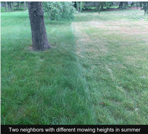
Two neighbors with different mowing heights in summer

It's no secret that New England lawns have a hard time looking good through the summer. Our grass varieties are meant to thrive in our cool spring and fall temperatures. Homeowners in our area don't usually opt for warm weather grass types because otherwise they'd only have green lawns for 3 months of the year. As many towns in MA have water restrictions during hot summer months, many homeowners feel like their lawn stands no chance of surviving July-September. How can we keep our lawns from going dormant and brown in the extreme heat and relentless sun? The solution is as simple as having proper mowing habits .