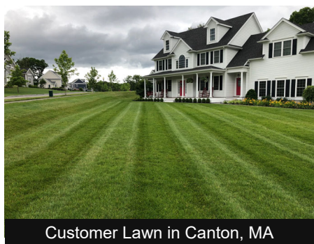
Customer Lawn in Canton, MA

Leave us a positive review on Google, Yelp or recommend us to your friends and family on Facebook!