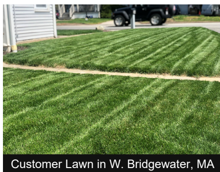
Customer Lawn in W. Bridgewater, MA