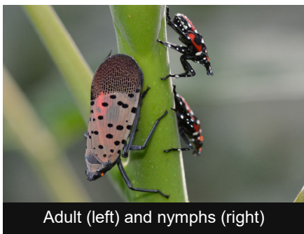
Adult (left) and nymphs (right)