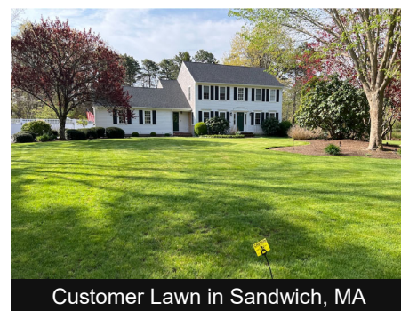
Customer Lawn in Sandwich, MA