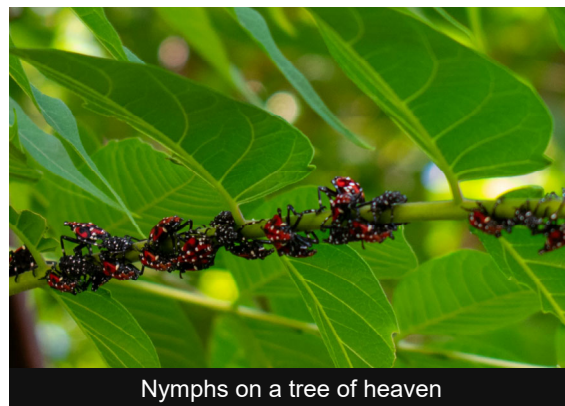
Nymphs on a tree of heaven

The preferred host of spotted lanternflies is a tree of heaven, a non-native tree used mainly as an ornamental. Other popular host plants include grapes, hops, and lilacs. However, spotted lanternflies will feed on a wide range of plants, so it's important to keep your eyes out for any potential eggs, nymphs, or adults all year round before they cause permanent harm. Spotted lanternfly damage appears as a sticky substance covered in a dark colored fungus known as sooty mold, which gives the damaged plant the appearance of having been burned. If you see a spotted lanternfly or its damage in Massachusetts this summer, take the proper precautions by taking photos, preserving the insect if you can, and reporting the sighting to https://massnrc.org/pests/slfreport.aspx .