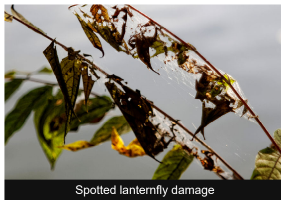
Spotted lanternfly damage