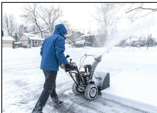
Snow blowers spread snow evenly

When relocating snow on your property, avoid piling it in one area , but rather spread it out evenly. Big, heavy piles