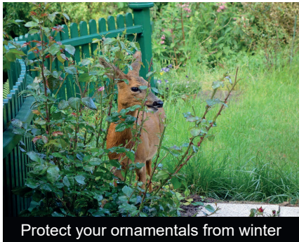
Protect your ornamentals from winter