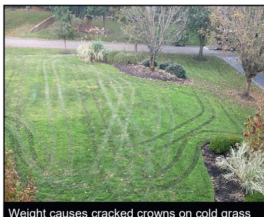
Weight causes cracked crowns on cold grass

pressure, weight or movement causes damage. Frozen grass blades actually break causing discoloration and usually comes back in the following growing season. If this happens too much, the grass will struggle to bounce back in the spring.