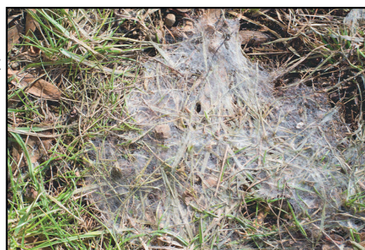
Snow piles can cause snow mold

end up with drainage issues and even mold if left piled on for too long. Parts of the lawn with excess snow or weight on it always have the hardest time greening back up in the spring.