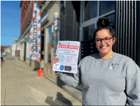
First we handed out flyers to local business to help recruit as many donors as possible!

This year, we hosted a blood drive! We invited the Kraft Family Donor Center's Blood Mobile to our Hanson office. The blood collected went to Dana-Farber Cancer Institute and Brigham and Women's Hospital. Because only 38% of people are eligible to donate blood and someone needs blood or platelets every 2 seconds in the US, we asked everyone we know to come donate blood. Check it out!