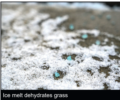
Ice melt dehydrates grass

Salt in the form of sodium chloride can harm your lawn. Be careful not to salt any of your grass. It can cause a drought-like effect by dehydrating the plant. Do not salt past your plow markers