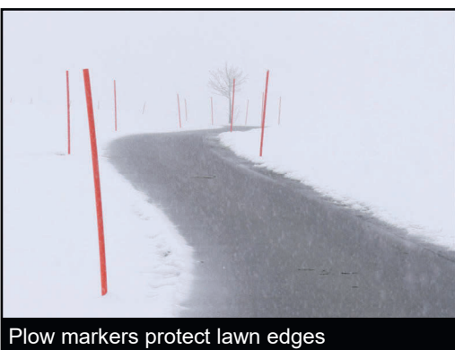
Plow markers protect lawn edges

At this point, all of your lawn's winter prep is probably done. The yard is clean of debris, the lawn is mowed short and all necessary nutrients have been applied. Now comes the winter and there's still some protecting you need to do to ensure your lawn makes it through unscathed. Here's how we recommend you deal with the snow this winter in regards to how it may affect your lawn.