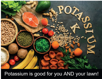
Potassium is good for you AND your lawn!

To be thorough, Lawn Doctor applies a good dose of potassium right before the winter to help lawns store water, nutrients and strength throughout the long, cold months. Potassium is our secret to a long-lasting lawn that bounces back every spring.