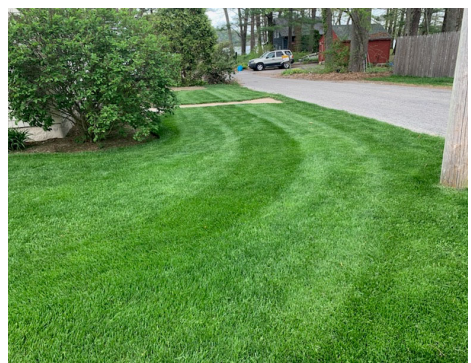
This prevents you from having to cut off more than 1/3 of the grass blade off at a time, which is damaging.