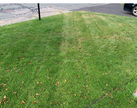
Do not mow shorter than 3 inches. Grass needs to create shade for itself to keep the soil temperature low.