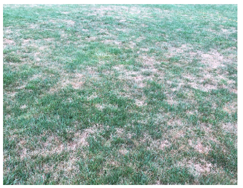
Watering at night means excess water will sit on the grass surface for too long and will promote fungal growth.