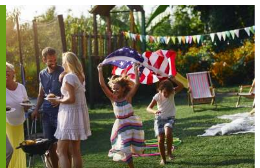
Control Mosquitoes on Your Property

Our Process : The patented Lawn Doctor Power Seeder, prepares the soil and delivers the perfect amount of seed maximizing the germination rate.